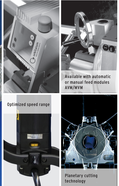
Available with automatic or manual feed modules AVM/MVM